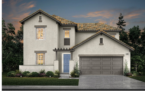
MODERN SPANISH B FLEX